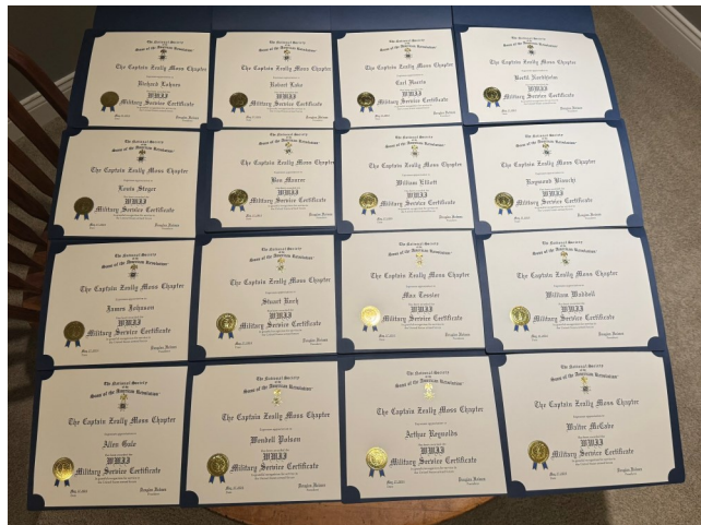
Captain Zeally Moss Chapter presented World War II Military Service Certificates at the Tazewell County World War II Veterans Event on May 27, 2024