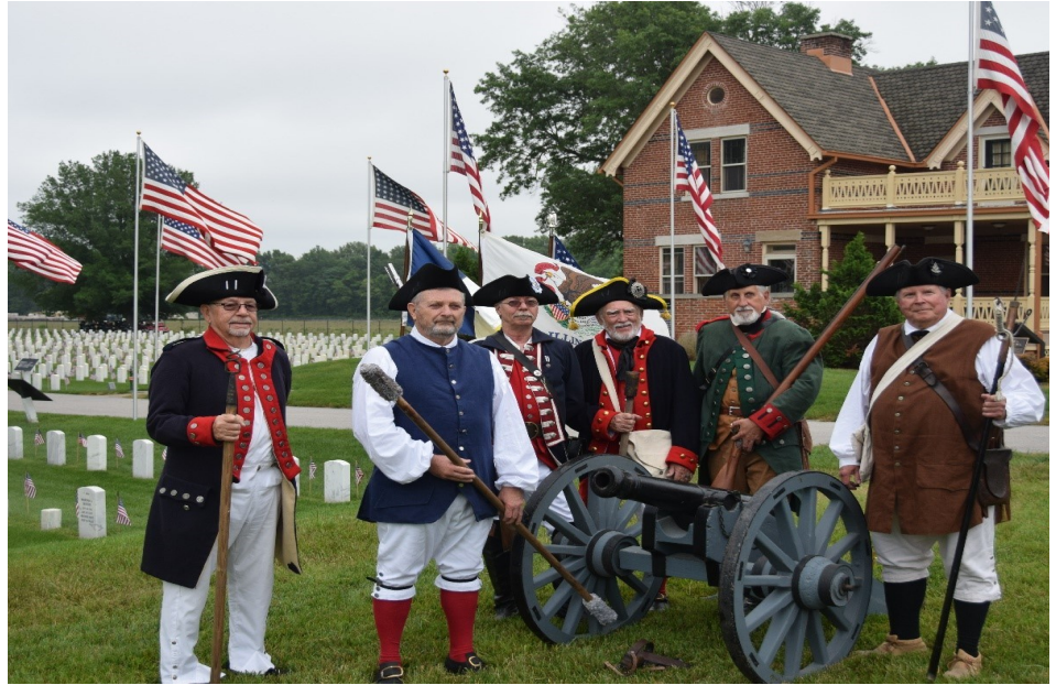
Long Knives Chapter Artillery participates in Mound City Memorial Day Service in Mound City.